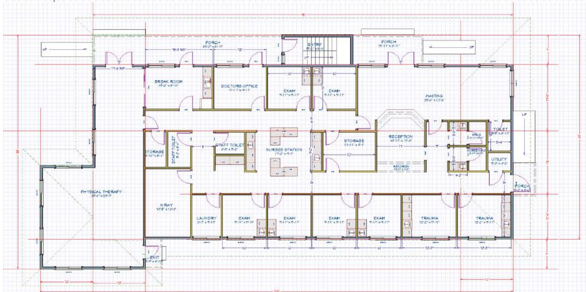
LIVING AREA 40.0 sq ft